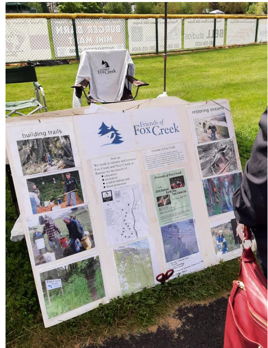
Friends of Fox Creek.