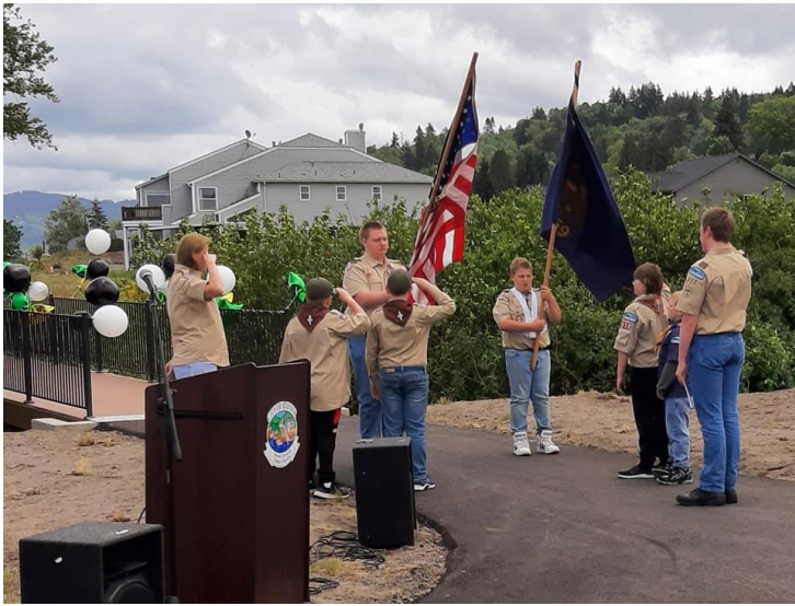
Flag salute by Boy Scout Troop #332.