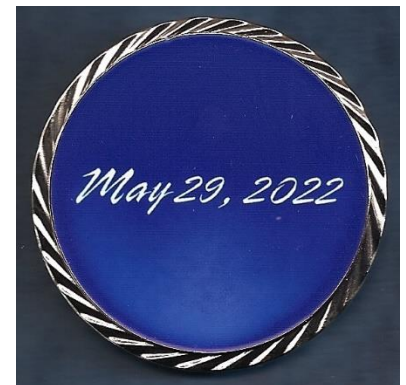
Commemorative coin handed out at dedication, 1 3/4" in dia.