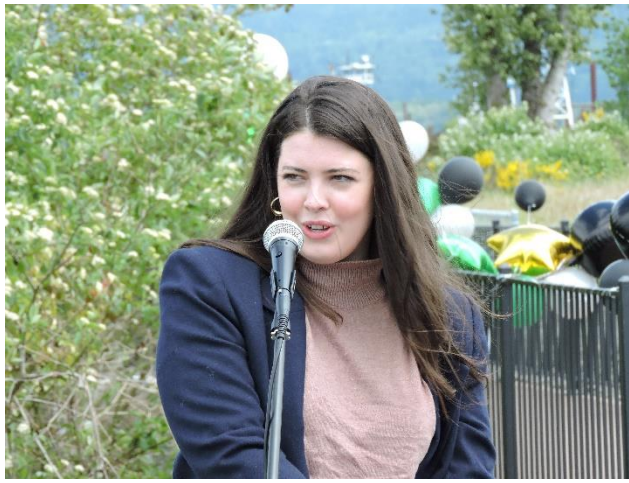
Oregon State Senator Rachel Armitage.