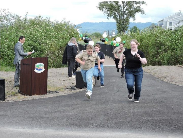
The fun run.