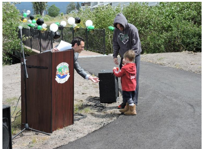
Winner of coloring contest receiving his award.