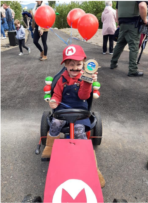
Winner of Most Creative and Original Award in the Trike and Bike Parade.