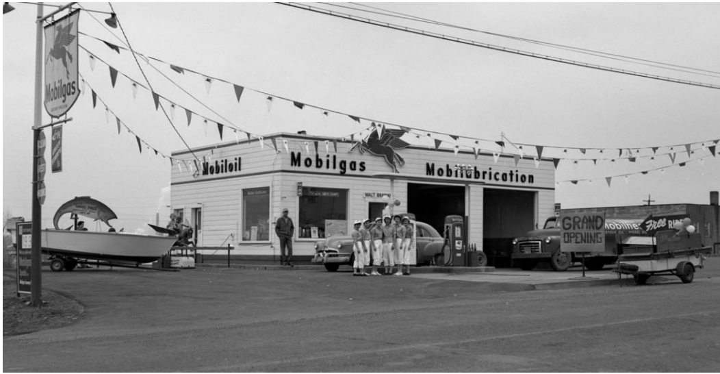
The grand opening of Walt Brawand and Tommy Keith's Mobil Station was held on April 13, 14 and 15, 1956, where the new transit center is located today.