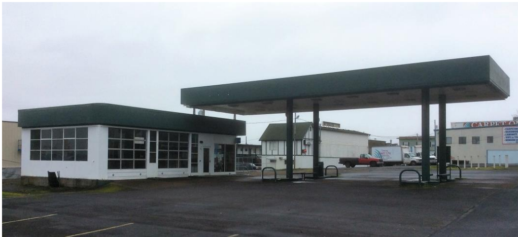
Recently the old gas station building, that had been altered over the years, was used by CC Rider until it was demolished in April, 2018, to make way for the new transit center.