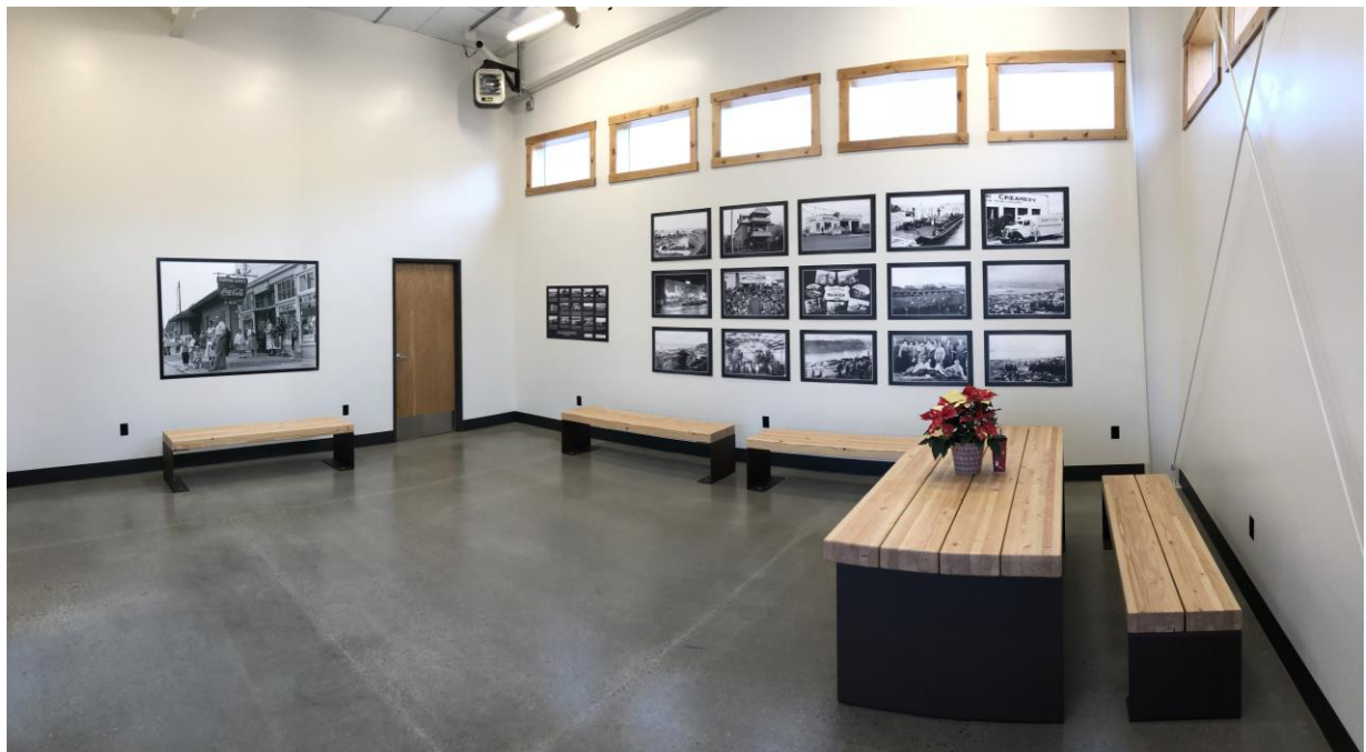
The interior of the Rainier Transit Center with permanent historical photo display.