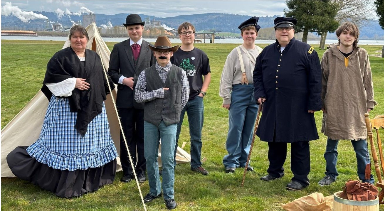
At the ceremony were members of the Rainier Jr/Sr High School History Club. They are planning to send a JV History Bowl Team to the Nationals in Arlington Virginia.